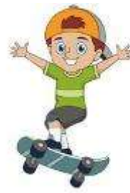
wheel and axle